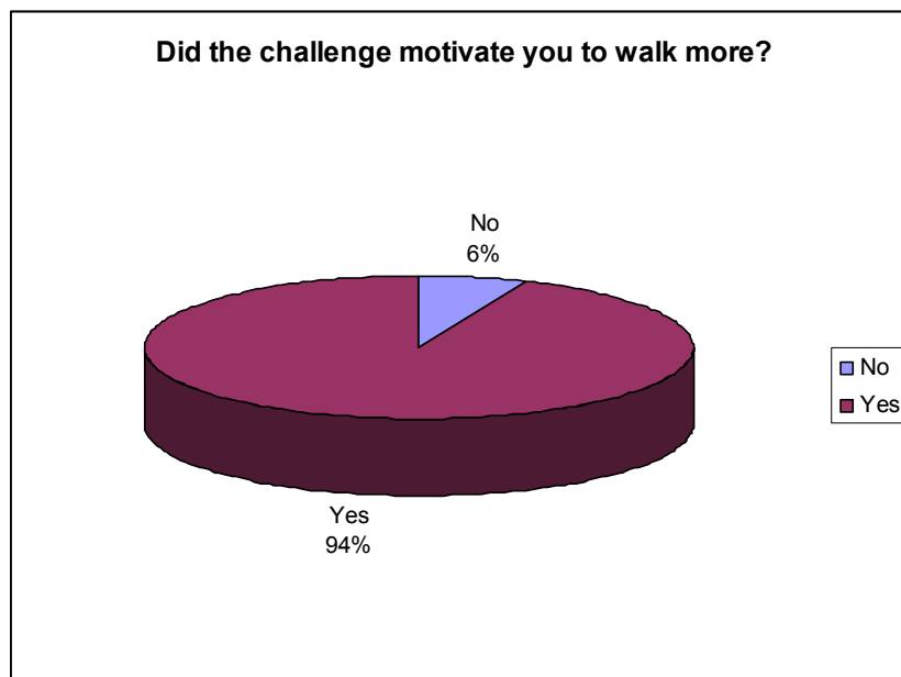
Figure 2 – Motivation for walking